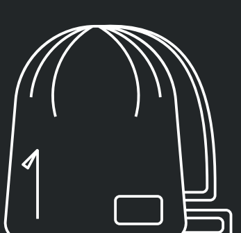
Backpacks & Cinch Bags (except athletes)