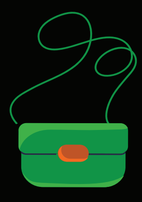
Clutch With Shoulder Strap (no larger than 4.5" x 6.5")