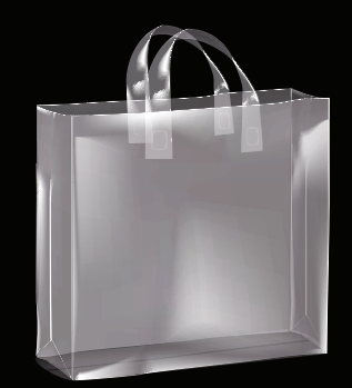
12" x 6" x 12" Clear Plastic Bag